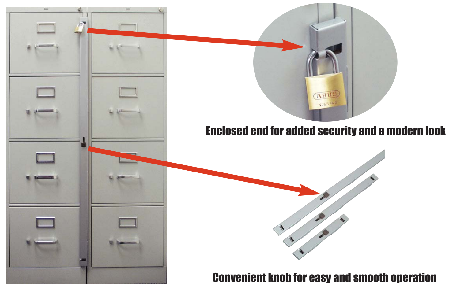
Available in 1, 2, 3, 4 and 5 drawer cabinets

The new ABUS File Bar has enclosed ends which give it a modern look. These enclosed ends also greatly reduce potential shipping damages. There is a conveniently located knob in the center of the file bar for easy and smooth operation. The file bars can be mounted on the right and left side by simply reversing this knob. There is no longer any need to disassemble the bar. The ABUS File Bar is constructed of heavy 16 gauge steel. All the hinges are locking lugs of 16 gauge steel. All mount screws are included with each bar.