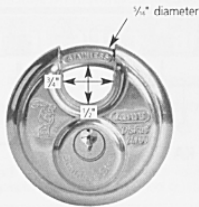
24/60 2 1/2" width