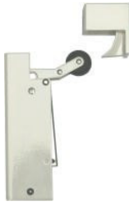
White (RAL 9010)