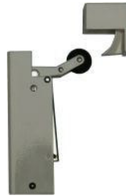
Grey (RAL 9006)