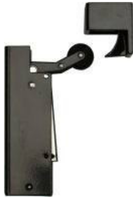
Chocolate brown (RAL 8017)